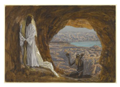
Between the Beasts and the Angels