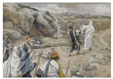
Merely Human Concern