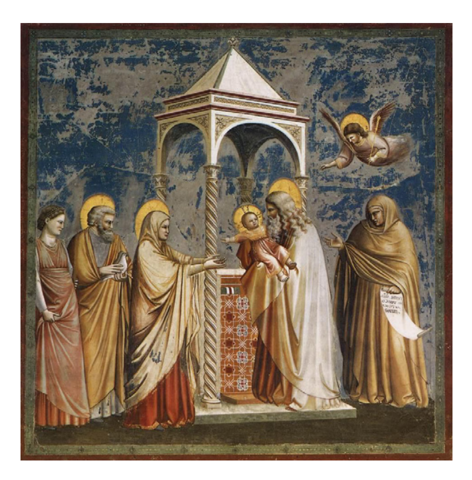
Giotto, Presentation of Christ at the Temple (Scrovegni Chapel, 1304-6).